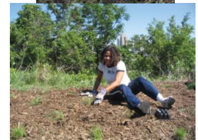
Clockwise from top: Girls eager to plant at Cargill Salt Facilities, Girl planting at West Side Bluffs, Mother and son planting a bur oak at Cargill Salt Facilities; all photos from 2006 events.

restoring the land, renewing communities