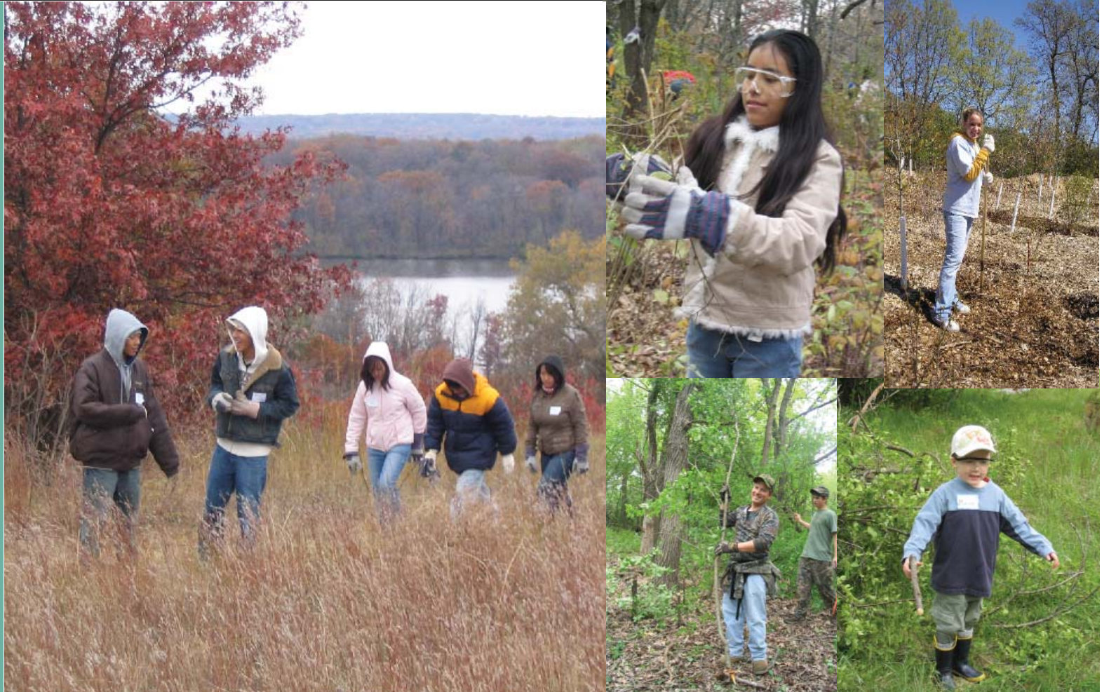
Clockwise from left: Teens walking through a bluff prairie at the Grey Cloud Dunes Scientific and Natural Area, Girl removing buckthorn at the Grey Cloud Dunes Scientific and Natural Area, Girl planting a tree at the Brooklyn Park River Park Maintenance Event, Boy hauling buckthorn at the Bucks and Buckthorn Spring Event, Volunteers removing buckthorn at the Bucks and Buckthorn Spring Event; all photos from 2006 events.