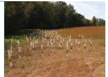
Oak Savanna sapling planting at Becklin Homestead Park / WMA