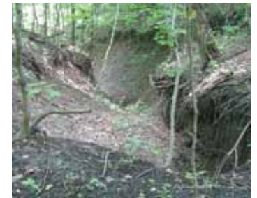
Gully erosion along Seven Mile Creek Watershed, Nicollet County.