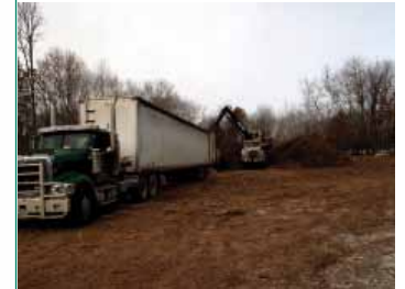
Cedar removal part of Oak Savanna Restoration at Rice Area Sportsmen's Club.