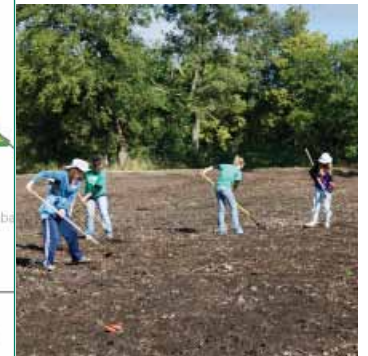
Prairie seeding at Pond Dakota Mission Park