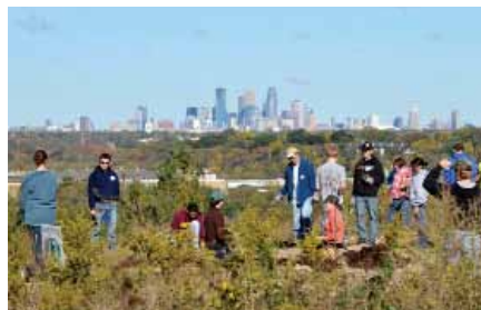
Prairie plug planting at Pilot Knob Hill.