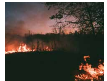
Prescribed burn at Flint Hills Resources