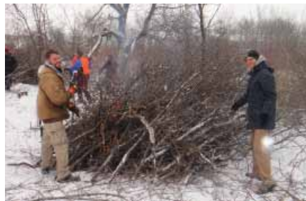
Buckthorn removal at Savage Fen SNA