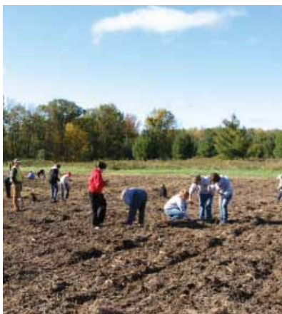
Acorn planting part of Woodland Restoration at Franconia Bluffs SNA