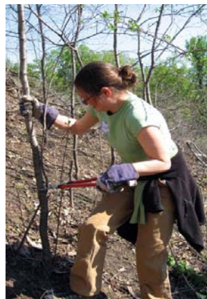
Top Right: Taking a break from raking Above Left to Right: Stacking brush Pond Dakota Mission 2010 Cutting Buckthorn at Pond Dakota Mission