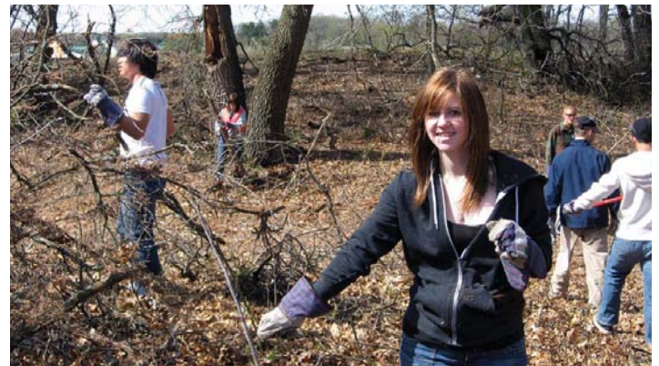
Clockwise from top left: Volunteers at Uncus Dunes 2010. Left: Mother and son cutting buckthorn © Cynthia Fleury.