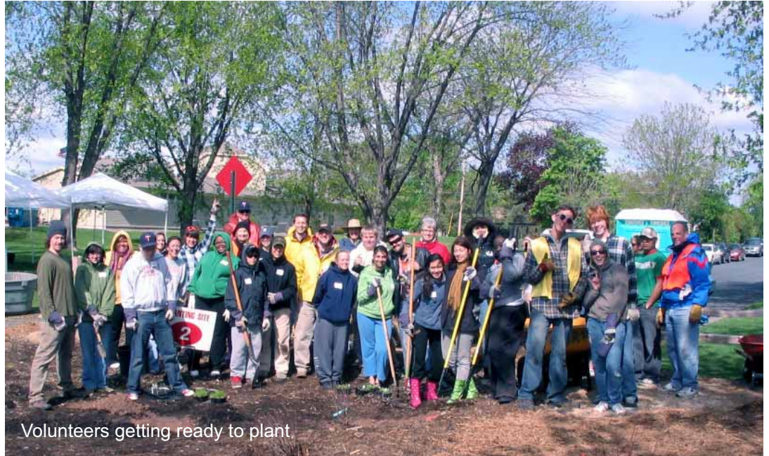
Volunteers getting ready to plant.