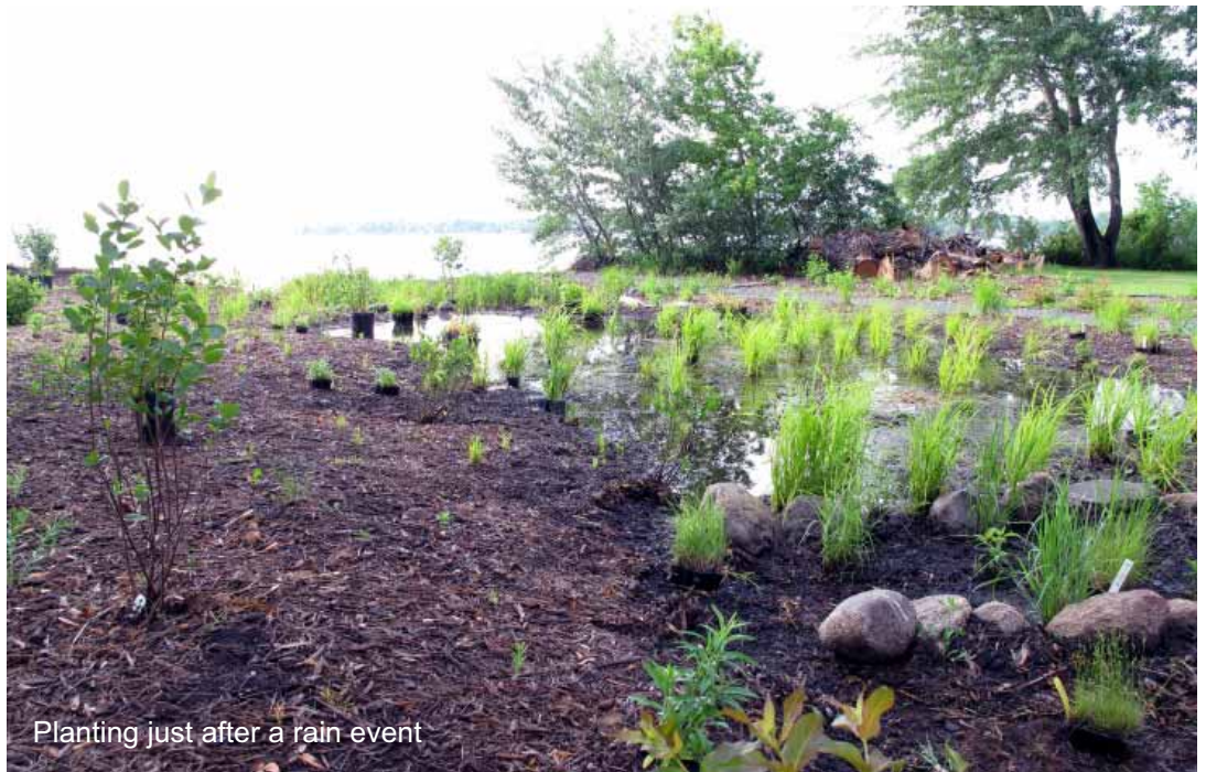
Planting just after a rain event