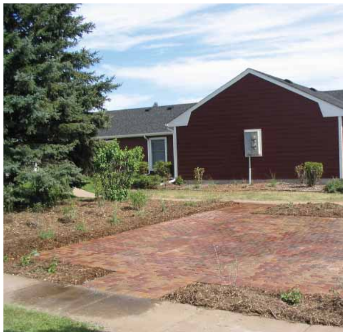
OFF THE SHELF PAVERS IN A PERVIOUS PATTERN