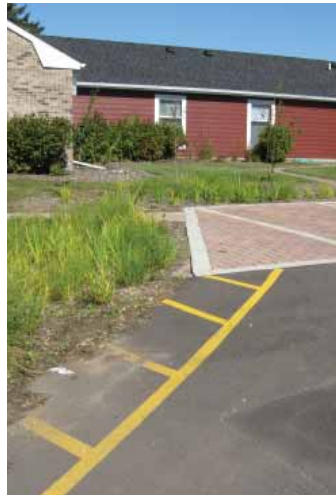
PERVIOUS PAVER PARKING AREA AND RAINGARDENS