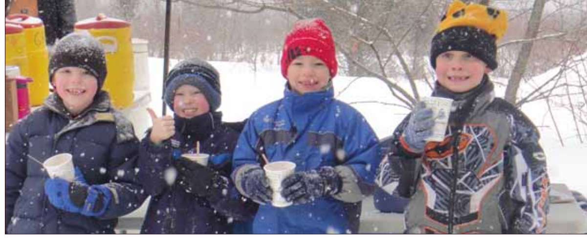
With your support, Greening staff, supporters and partners lead, assist, and inspire volunteers and communities to improve the region's natural resources by strengthening ecological systems and promoting stewardship and management of critical lands and waters. We choose our projects based upon conservation need, ecosystem services provided, and community benefits.