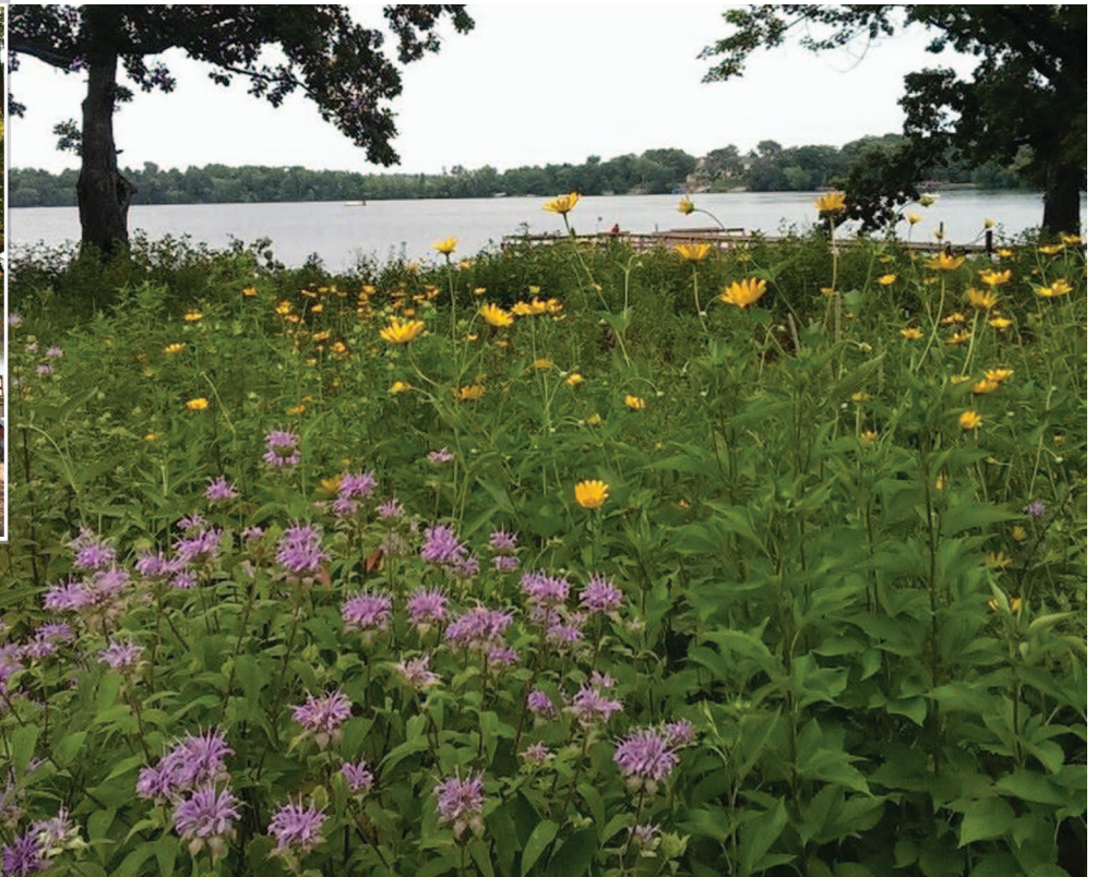
Before and After - Cedar Lake Farm in New Prague