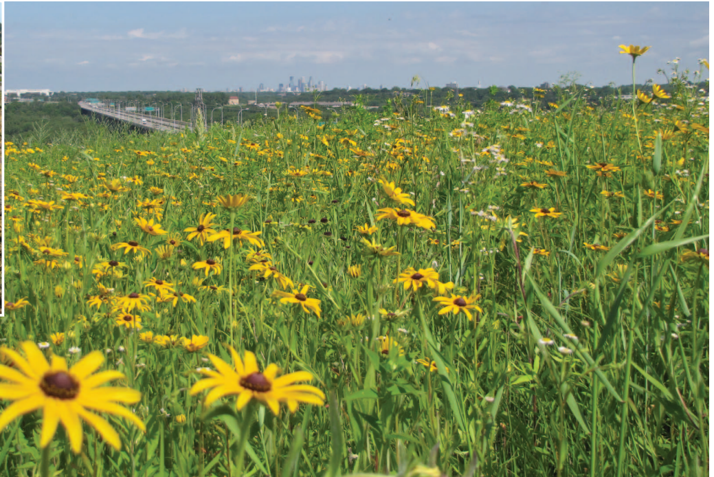
Before and After - Pilot Knob in Mendota Heights